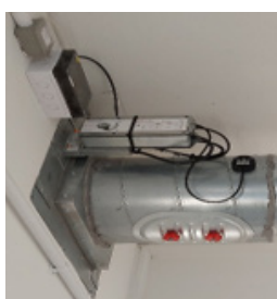
Motorised fire damper